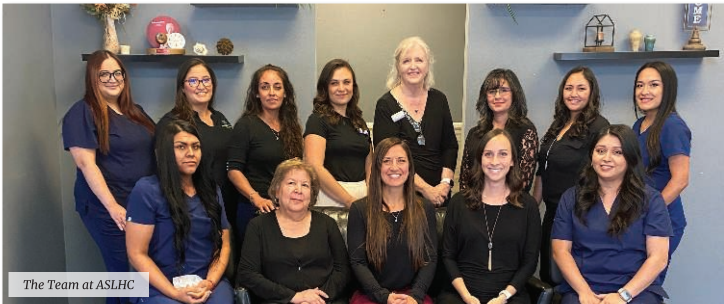
The Team at ASLHC