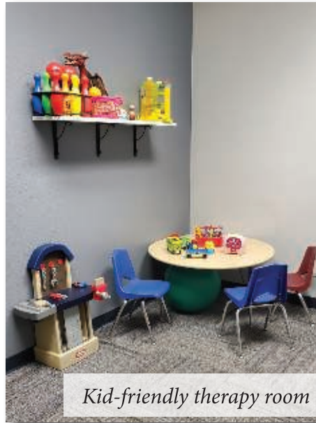
Kid-friendly therapy room